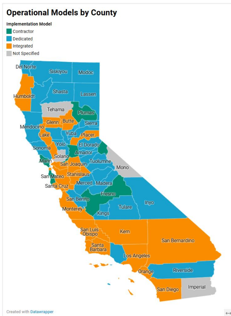
Figure B. Operational Models by County as of December 2024*

*Operational models are pictured here as reported to CDSS in December 2024. County-specific operational models could change over time and may not match the models described elsewhere in this report.