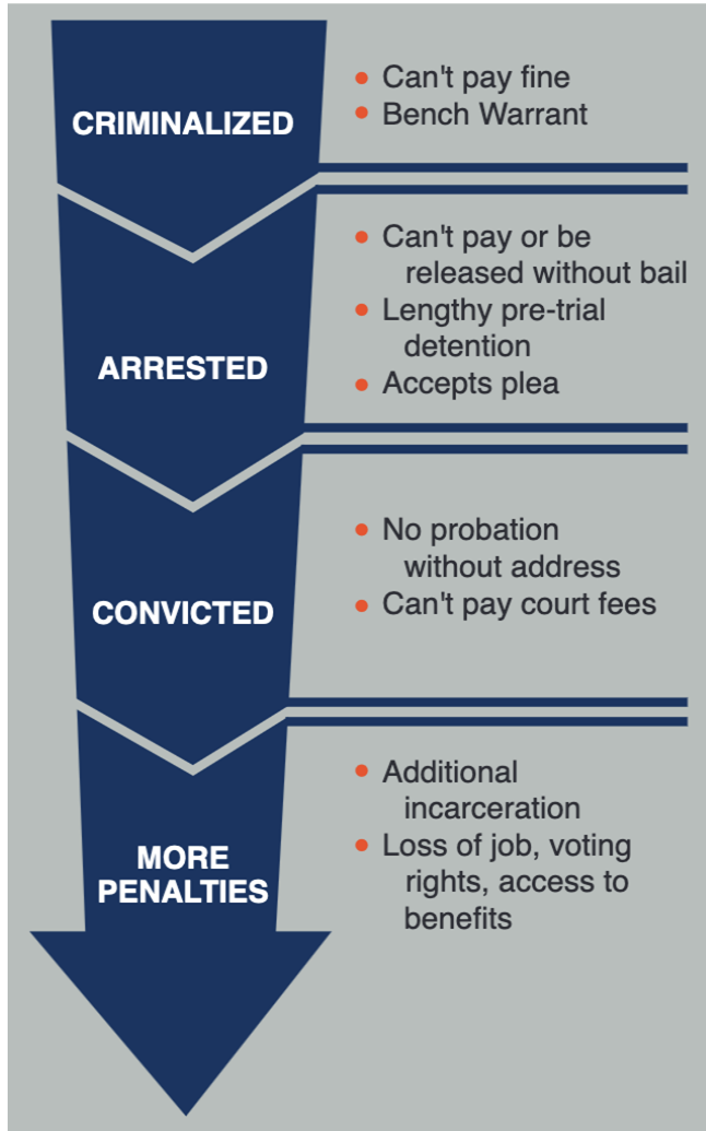
Graphic: National Homelessness Law Center